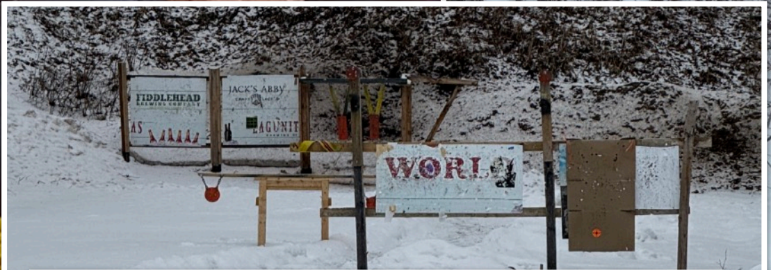
Rifles at 50/75/100 yards