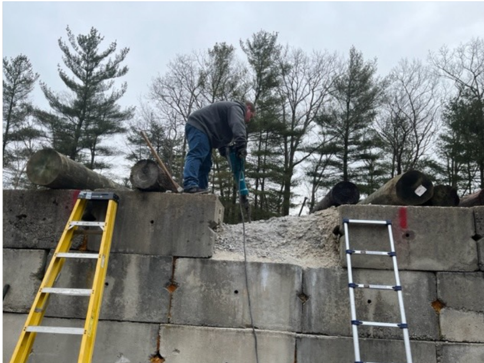
Dan Belanger removing a damaged block before the new one is installed.